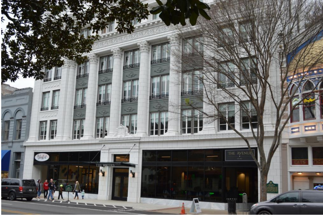
The Waters welcoming exterior shows classical inspiration.

The morning of the Rebel Stakes, we saw Triple Crown-winning jockey Victor Espinoza checking out of The Waters. During our stay, we visited in the restaurant and bar with many other racing fans and insiders. I am confident the hotel will continue to grow as a hub for visitors to Oaklawn.