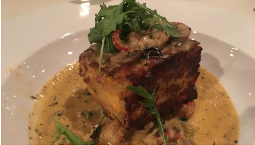
Start and amazing meal at Bone's Chophouse with the crawfish cornbread.

Racing fans heading to Hot Springs, Ark. for the Grade 1 Arkansas Derby on April 14 at Oaklawn Park have plenty of options for dining.