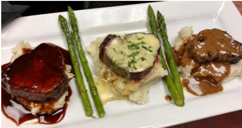
Dinner entree at Bone's Chophouse.

No matter the budget, a winning plate awaits in the Spa City.